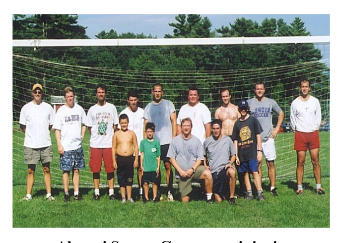
Alumni Soccer Game - no injuries