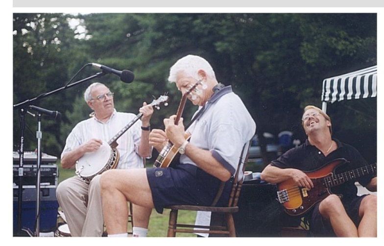
CT Alumni Jam Session