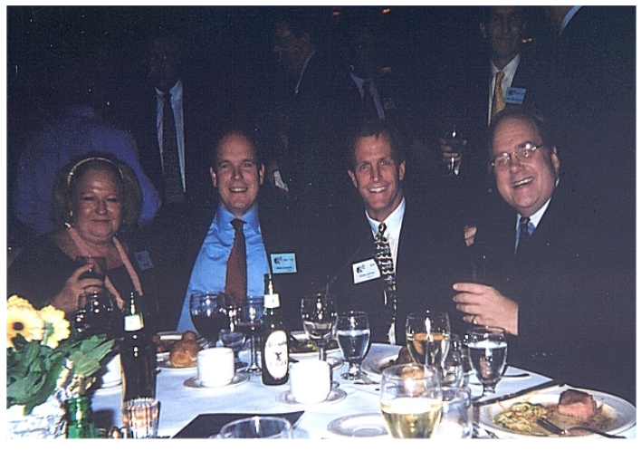
A Royal Affair