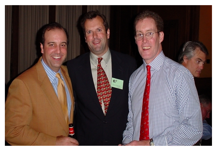
The 3 wise . . . men