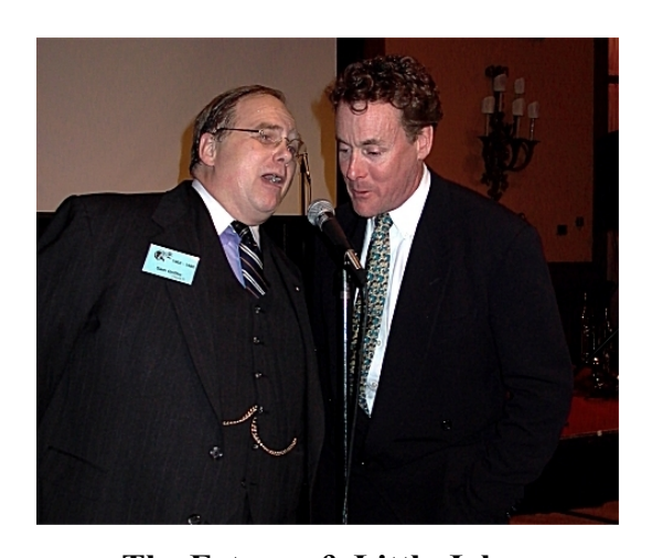
The Fatman & Little John