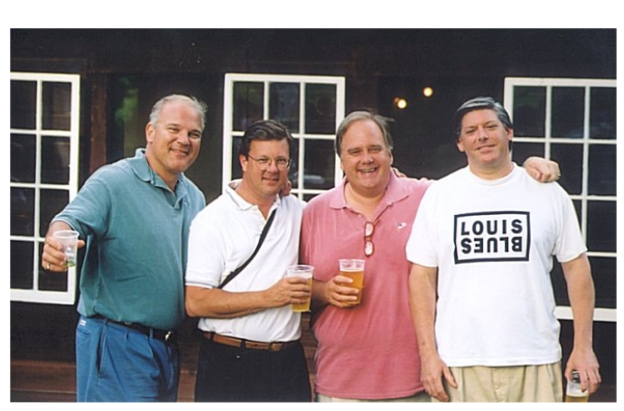
Legends of the 60s